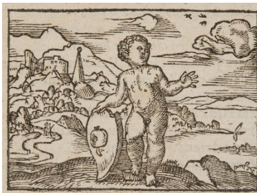
1583, n. 113, p. 368.