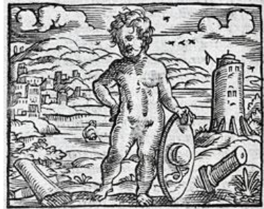
1567, n. 96, p. 96.