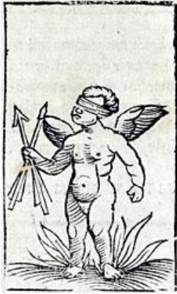
1531, f. E7v.