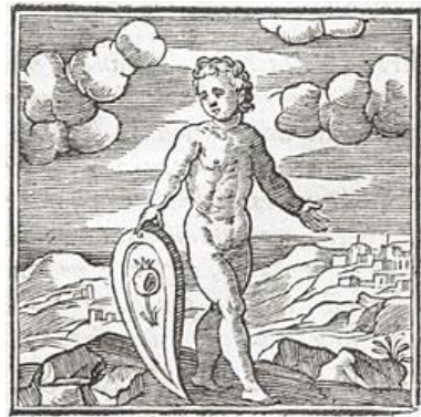
1621, n. 114