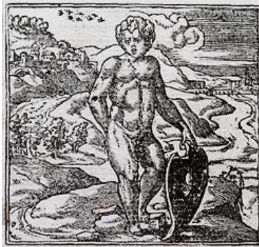
1551, p. 123.