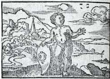
1547, n. 97, p. 100.