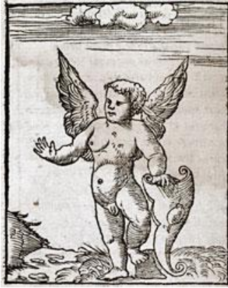
1534, p. 102.