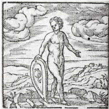
1577, n. 113.